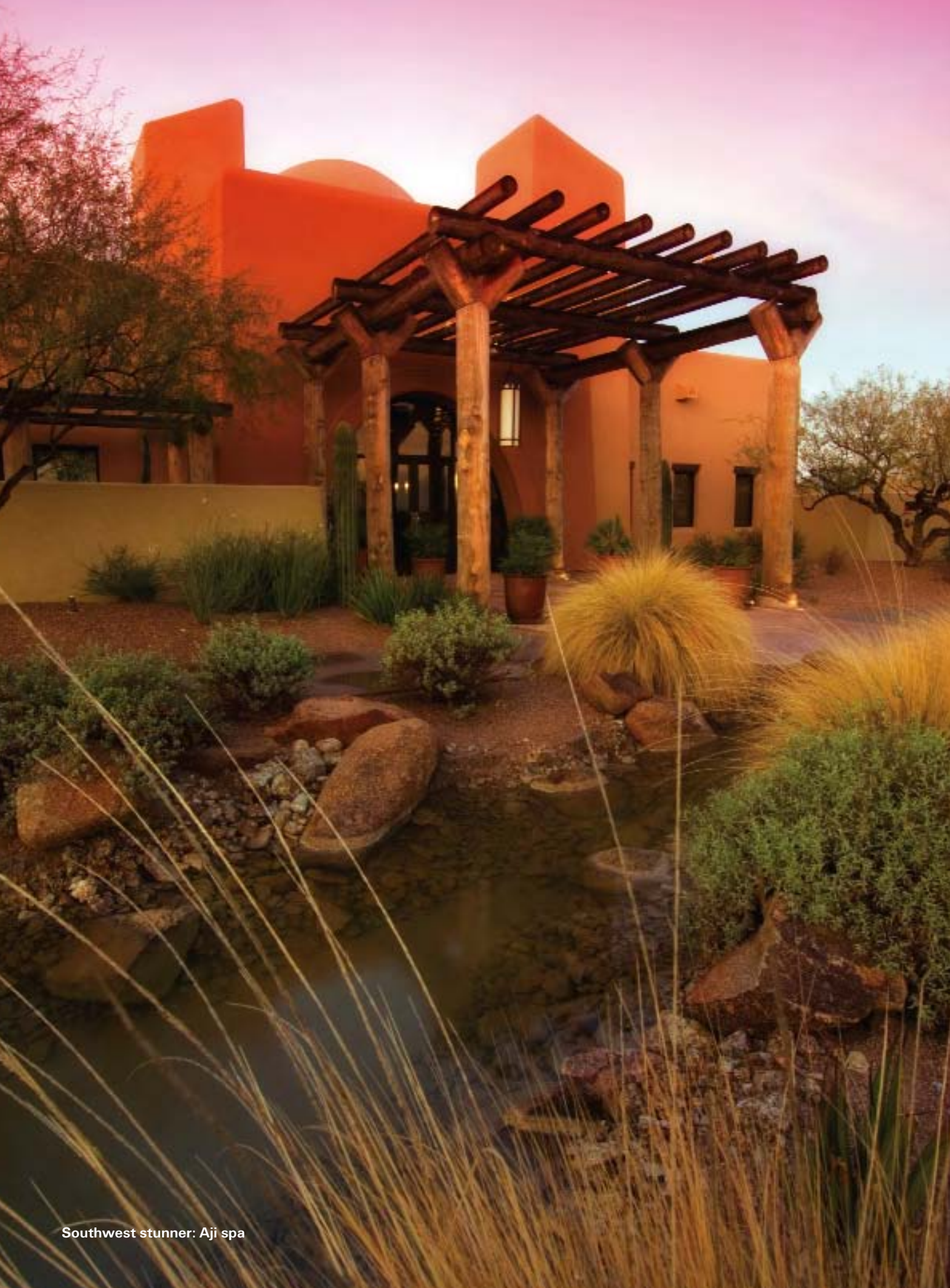
Southwest stunner: Aji spa