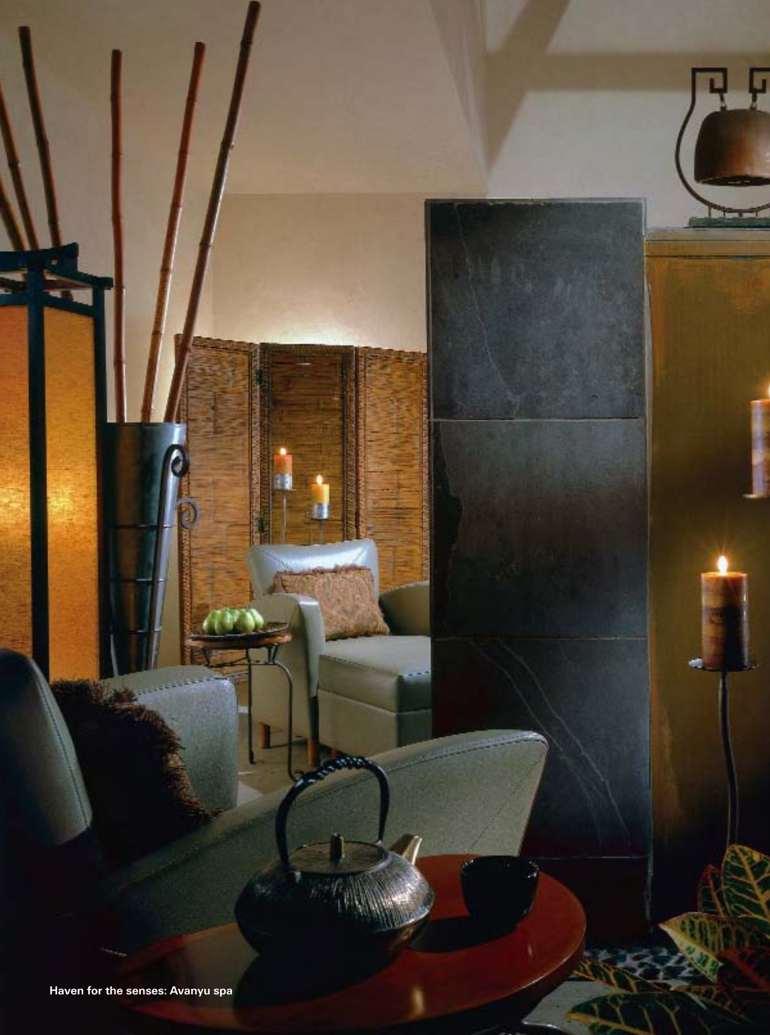
Haven for the senses: Avanyu spa