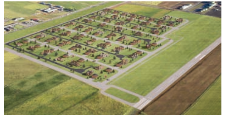
Top: The awe-inspiring beauty of Flathead Lake, Montana's Lakeside Club Airpark. Bottom: Spectacular Afton Airpark thrives outside Jackson Hole, WY.