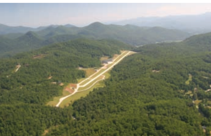
The Blue Ridge Mountains of Northeast Georgia offer aviators heaven on earth at Heaven's Landing.

taxi right off the Afton Municipal runway to the 54 homesites created especially for those of us who live to fly, or vice versa. And with a runway exceeding 7,000' (longer than Jackson Hole Airport) you can live with almost any aircraft you desire. This airpark is unique, having a full service FBO with 100LL, Jet A, and indoor hangars for everything from a Mooney to a Gulfstream GV. If this is a second home for you at Afton Airpark, call prior to your arrival and the staff will make sure everything you desire is waiting in the refrigerator and pantry. It's also the perfect base camp to visit Wyoming attractions like Yellowstone, Grand Teton National Park and some of the best fly fishing in the world.