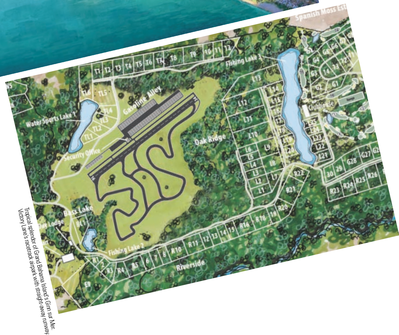
Tropical splendor of Grand Bahama Island's Ginn sur Mer. Victory Lane's race-track airport with straight-away runway.