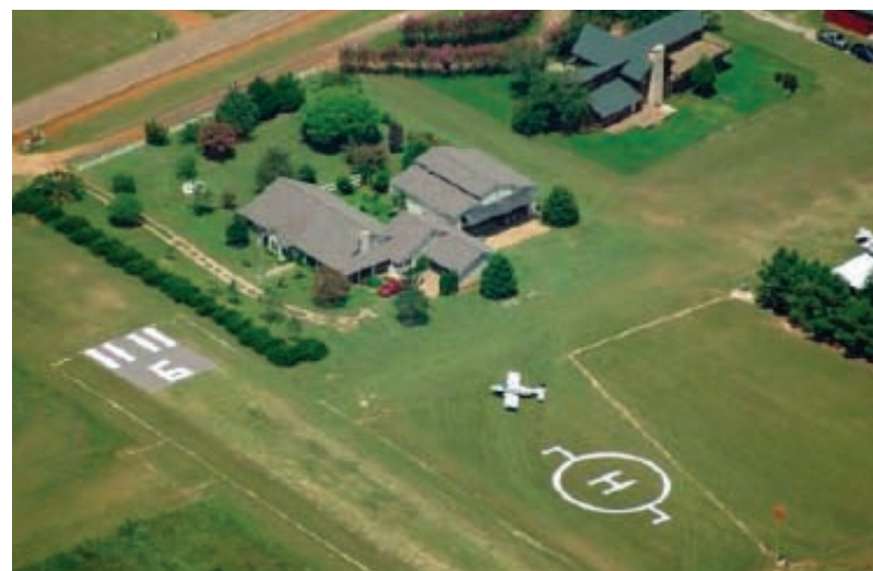
Aero Estates Airpark on Lake Palestine in Frankston, TX beckons live here

CALL PRIOR TO YOUR ARRIVAL AND THE STAFF WILL MAKE SURE EVERYTHING YOU DESIRE IS WAITING IN THE REFRIGERATOR