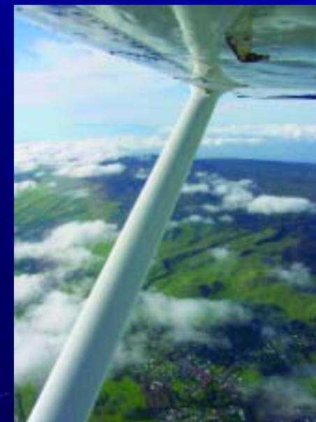
Coral reefs off sacred Pu'u'honua o Honaunau, or "place of refuge," offer Hawaii's ultimate diving and snorkeling adventure; (inset): A yearly rainfall of up to 200 inches is the tropical lushness seen from above