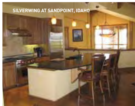
SILVERWING AT SANDPOINT, IDAHO

blossoms in the spring and the fall colors ever autumn, and you begin to see why Heaven's Landing can steal your heart on the very first visit. Batavia, Ohio, home of Sporty's Pilot Shop, now features an airpark as well. Sandy's Farm is a gated community with instant access to the GA-friendly, 3700-