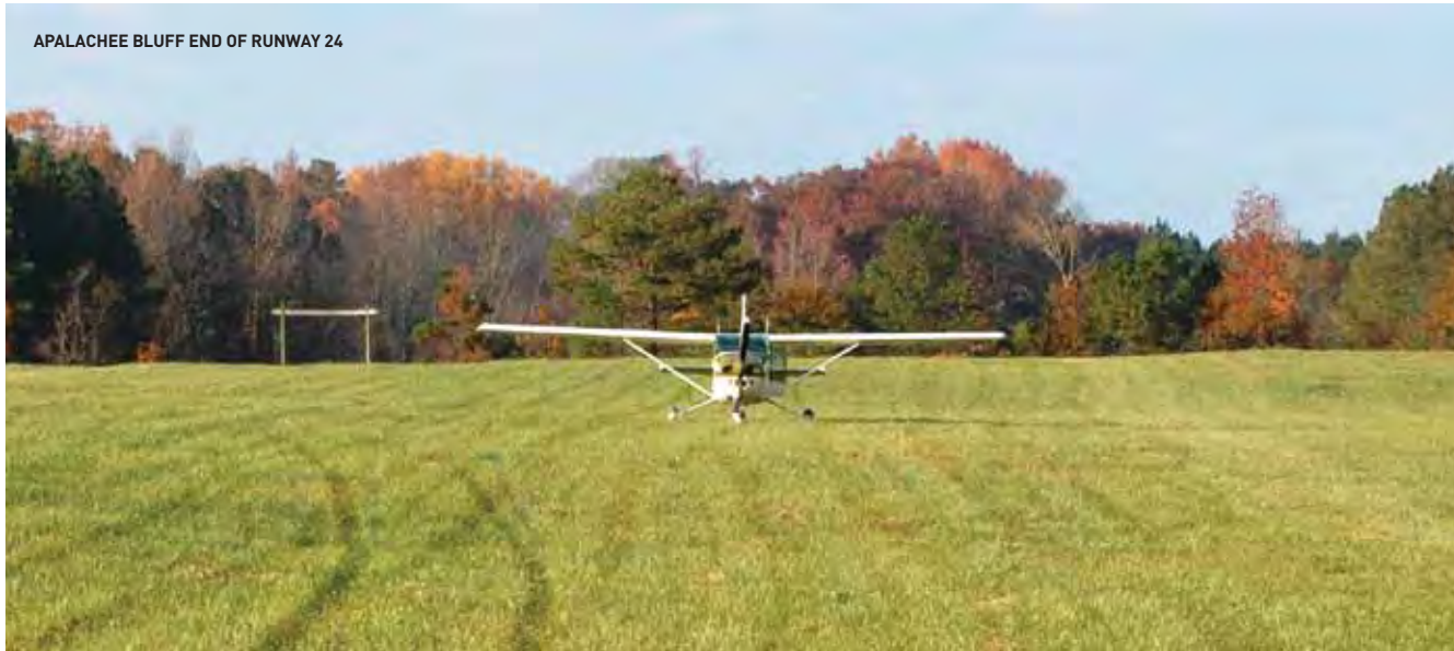
APALACHEE BLUFF END OF RUNWAY 24