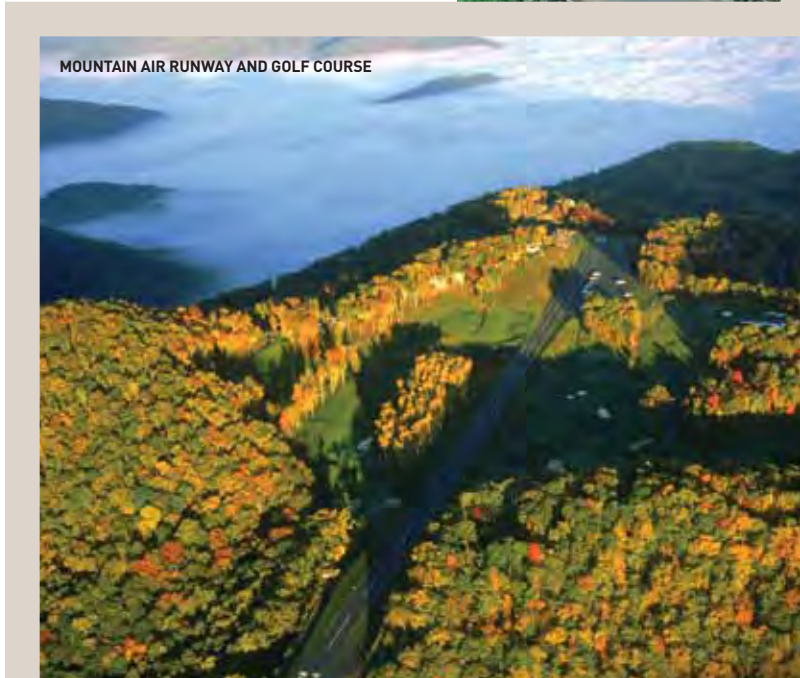
MOUNTAIN AIR RUNWAY AND GOLF COURSE

FA FACTOID The FAA is withholding federal funding to airports that have hangar homes at publicly funded airports. Stay informed by visiting ThroughTheFence.org .