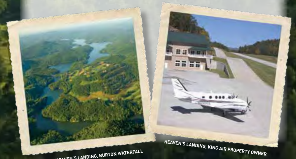
HEAVEN'S LANDING, BURTON WATERFALL