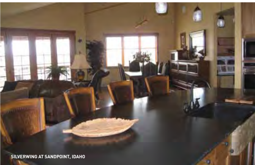
SILVERWING AT SANDPOINT, IDAHO