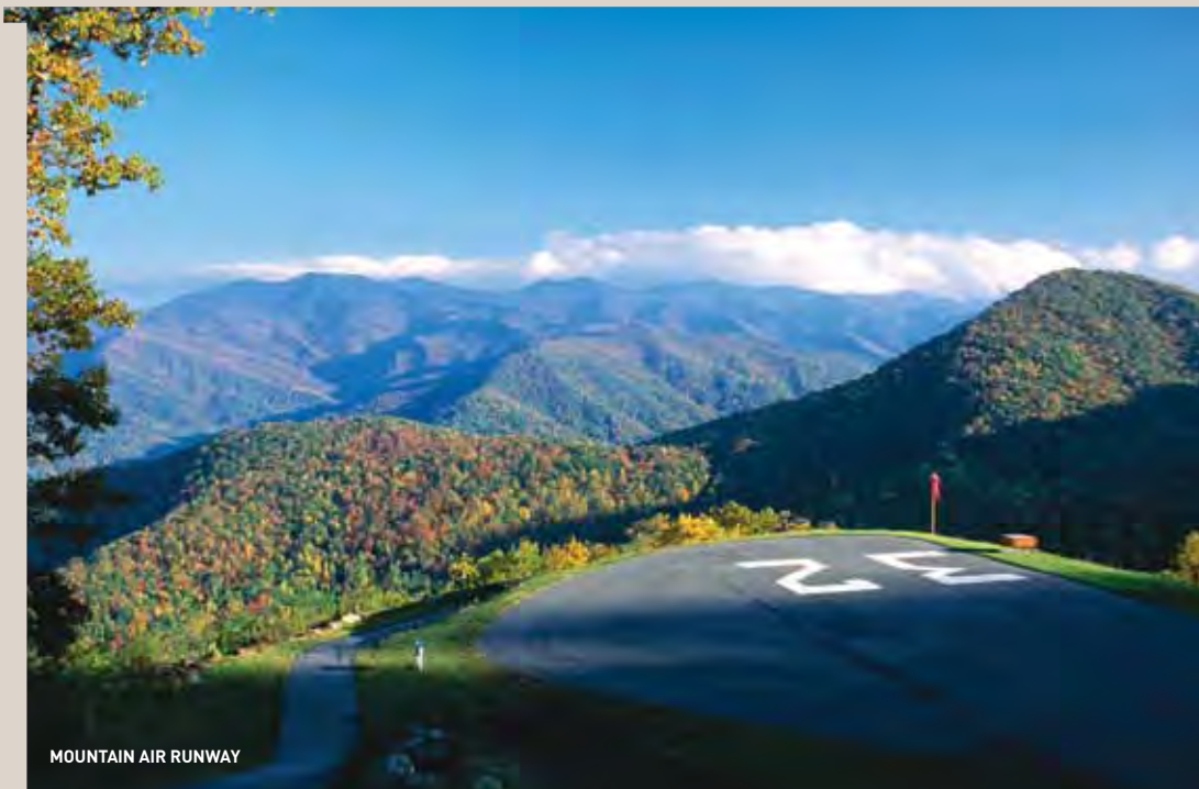
MOUNTAIN AIR RUNWAY