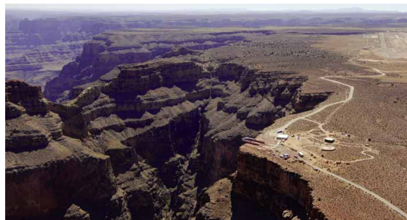
Opposing page: reclining woman on bridge's glass floor; Skywalk admired in profile (above) or from the air is within easy sight of Grand Canyon West Airport.