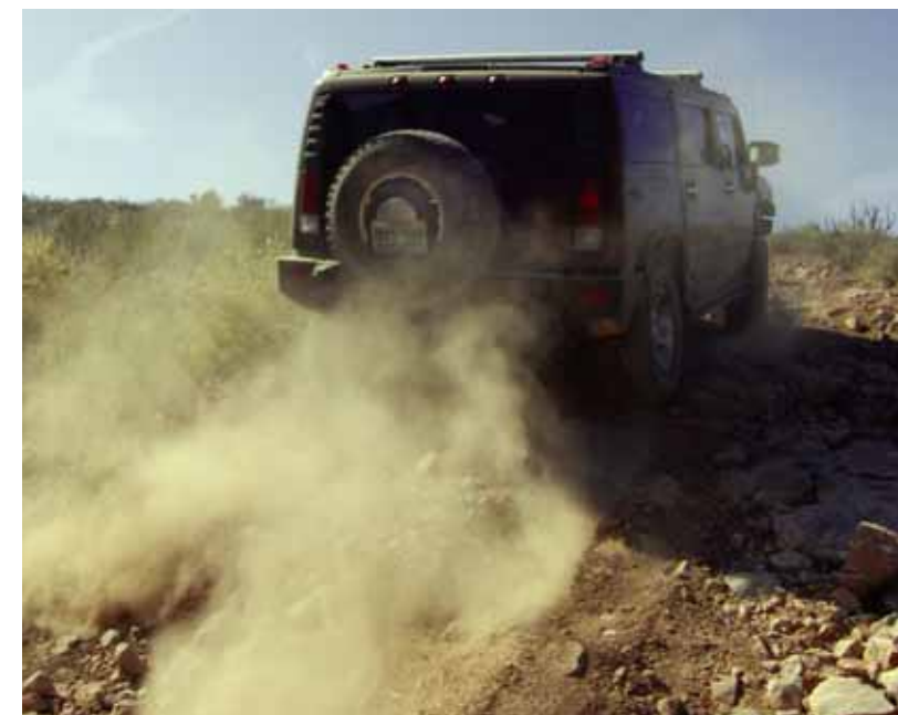
Opposite page: Nature's work of 6 million years, a kaleidoscope of pattern and hue; this page: Wilfred Whatoname and Skywalk's choice sightseeing vehicle, the Hummer.