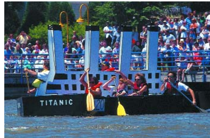
Mood Mozart. A magical evening of music at the Well Center outdoor theater (left); Wisconsin wacky happens at the annual Cardboat Boat Regatta and baseball game Bed Races (right); eye-popping tilework of the Art Center restroom (below)

I’m tipped-off to the glorious golf: There