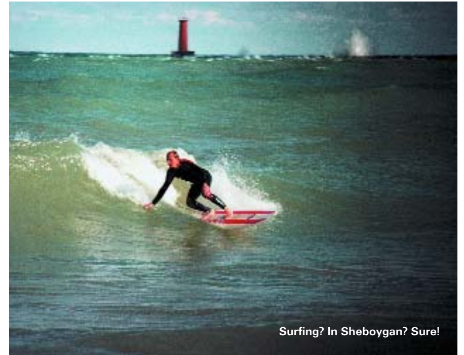
Surfing? In Sheboygan? Sure!

For details on these and other Sheboygan delights, explore www.sheboygan.org or call 800.457.9497.