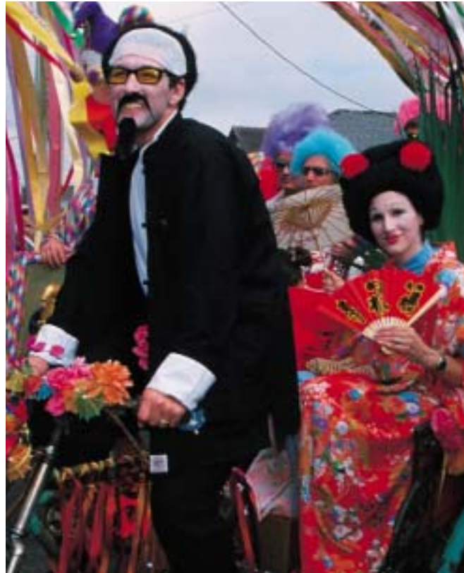
Madcap masquerade fantasies are flaunted at Mardi Gras (left); the streetcar of St. Charles Avenue, where miles of grand Southern mansions are on view (right)