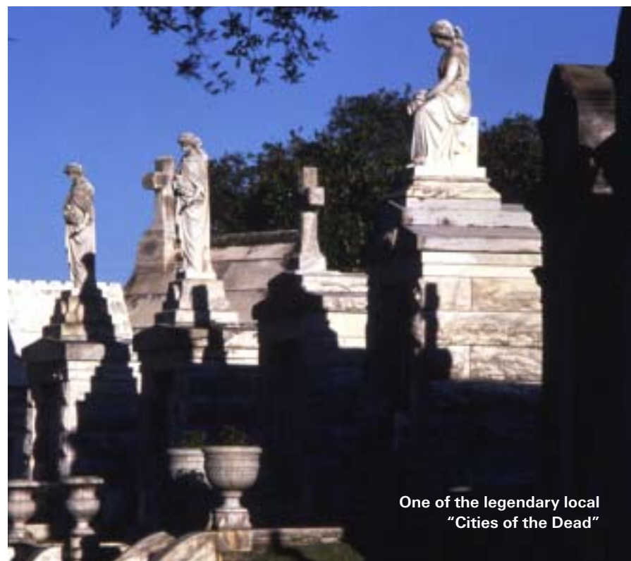
One of the legendary local "Cities of the Dead"

its less frat-partyesque charms. It's a lovely day. Now that I've made quick work of my second beignet, I think I'll take a walk, or two. Ever since 1803 when Napoleon on behalf of the French sold 500 million acres of the Louisiana Purchase to Thomas Jefferson on the cheap – $15 million – swamp-side New