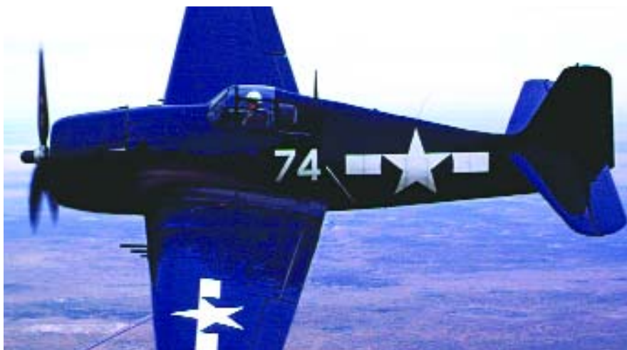
Military mights (top to bottom): The Hellcat, Bearcat and Zero. The yellow A Cat serenely surveys its surroundings (opposite)

pid things in it. What you couldn't do was kill yourself with it: you'd walk away."