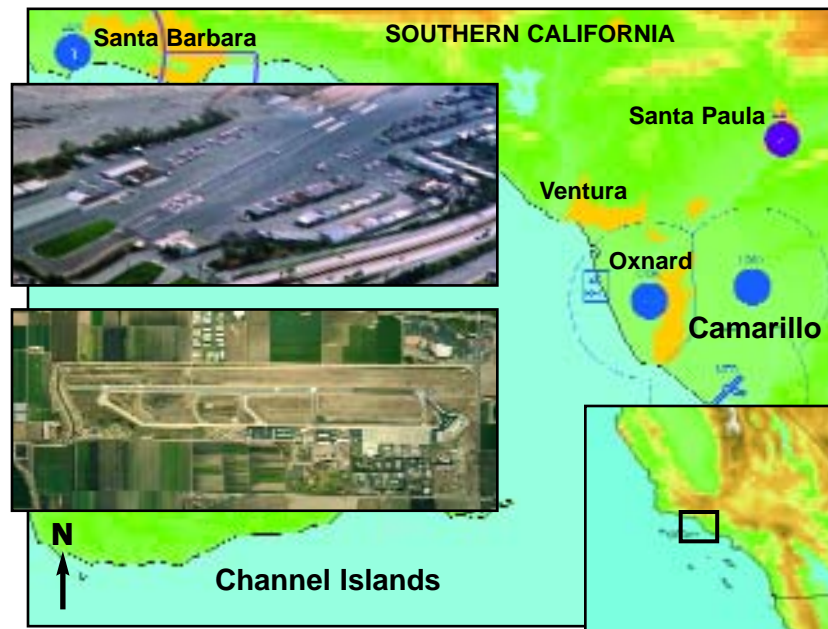
Profile map viewed from Camarillo Airport to Santa Paula Airport looking north