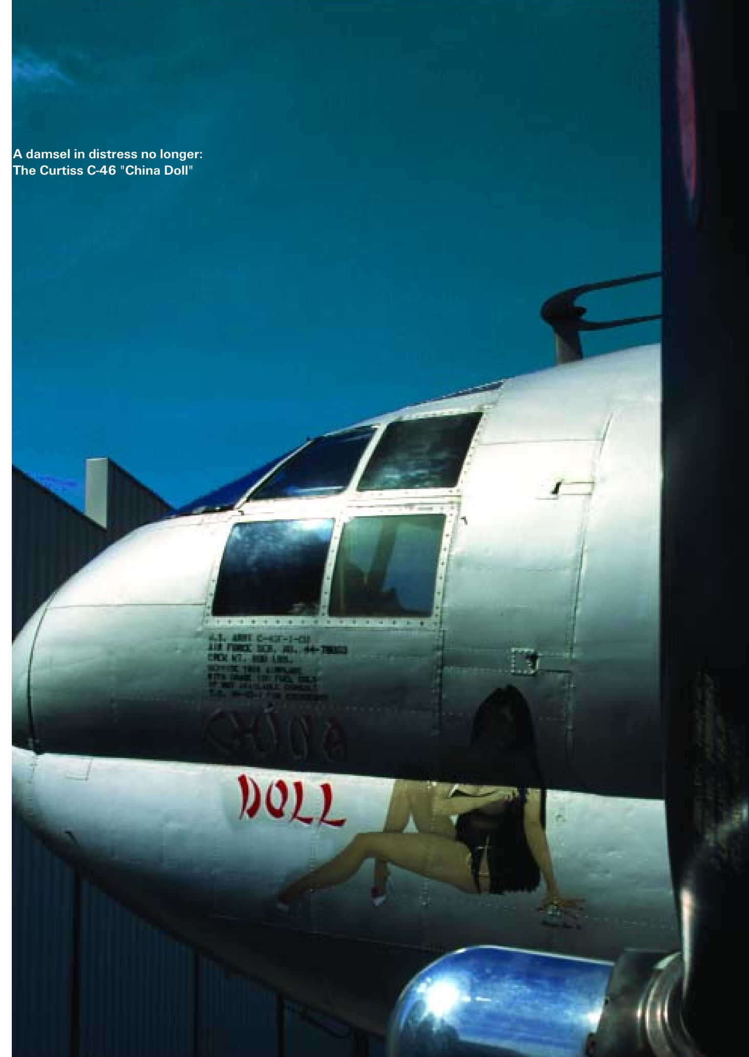
A damsel in distress no longer: The Curtiss C-46 "China Doll"

Join the gathering by calling (805) 482-0064 or visitingorgsites.com/ca/caf-socal . ✕