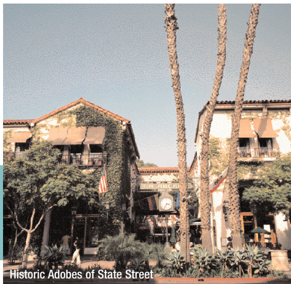
Historic Adobes of State Street