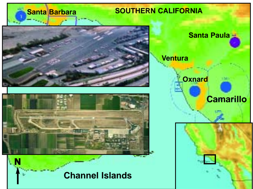
Profile map viewed from Camarillo Airport to Santa Paula Airport looking north