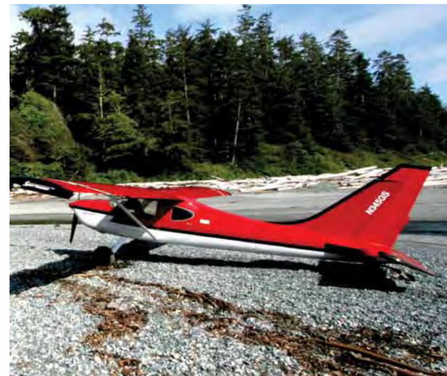
The Glasair Sportsman 2+2 is a popular example of the new experimental aircraft coming from builder-assistance programs.