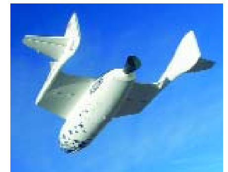
It's a bird, it's a plane, it's a rocket into space: Rutan's fantastic, future-is-now SpaceShipOne

For if it isn't his solitary hours designing – "almost solely done on evenings and weekends...I certainly do enjoy it" – it is marketing, proposals...and tinkering. "I also get in and work on building airplanes," he says. "I get my hands dirty, still." ✕